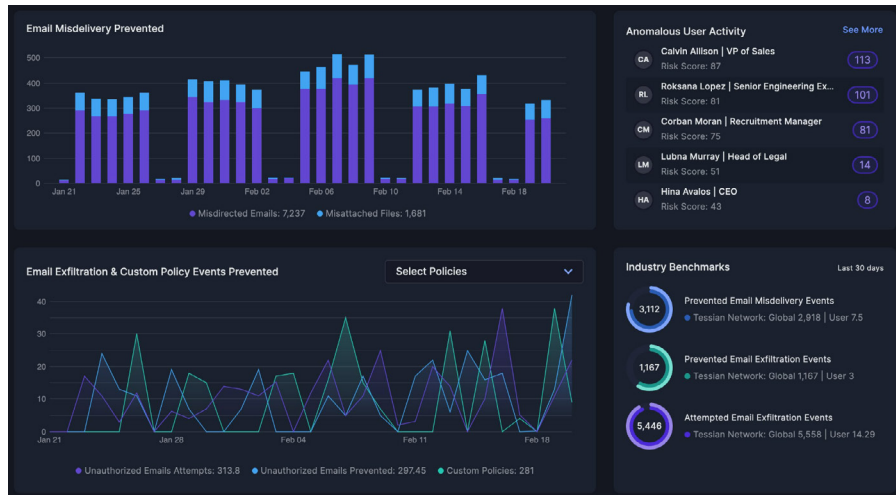
Figure 2: Security teams have increased confidence into email data loss visibility.